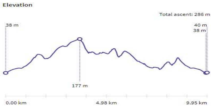
Autumn 10km Course (Ascent 286m)